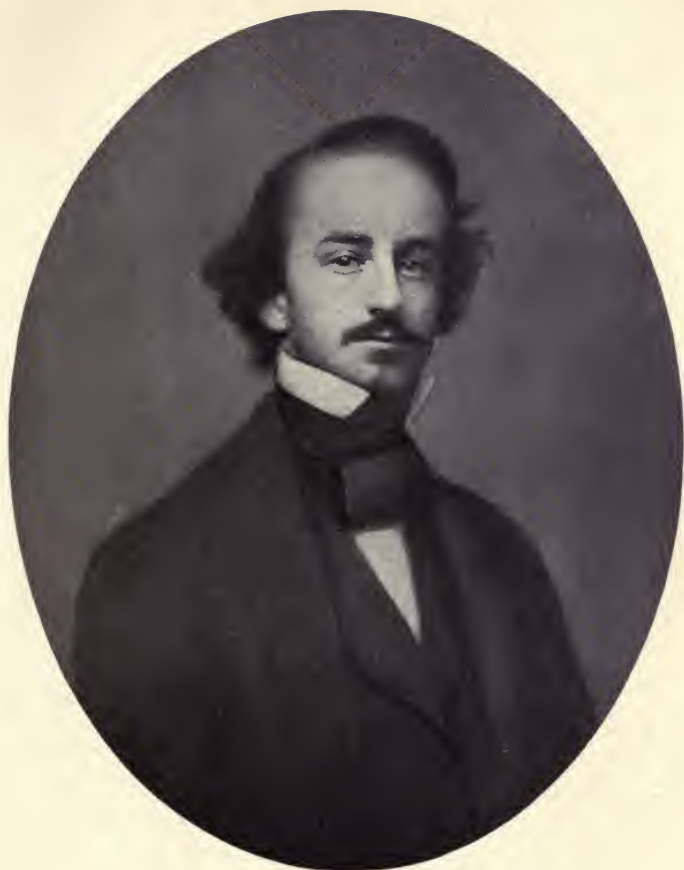
LYMAN ABBOTT ABOUT 1855